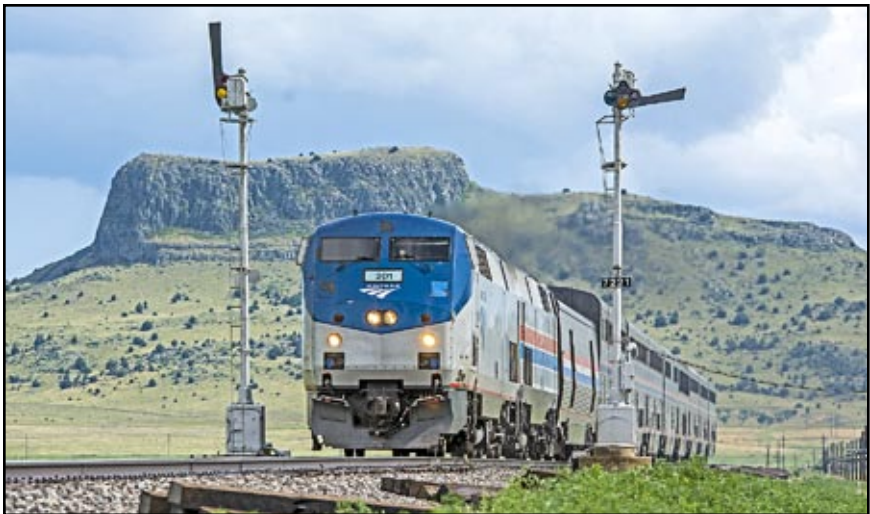
Amtrak's Southwest Chief between Trinidad to Santa Fe.

The Rail Report masthead features Victorian Railways R-Class 731 (North British No 27021 of 1951) on a Melbourne bound passenger train at Pascoe Vale, 7-miles north of the capital in the early 1960s.