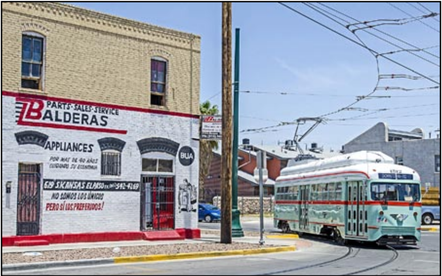
El Paso's streetcar line operating historic cars.