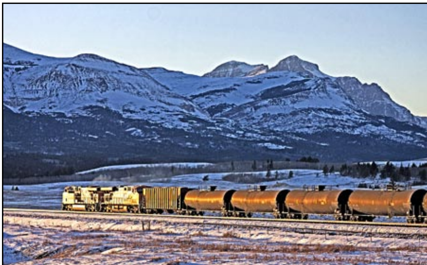
A BNSF Railway oil train approaches East Glacier, Montana, on the edge of Glacier National Park during the winter of 2013.