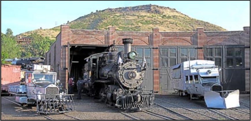
Trains magazine partnered with the Museum to stage photography opportunities on August 2, 2020. A Rio Grande Southern scene included Work Goose 6, No. 20, and Goose 7 staged outside the roundhouse.