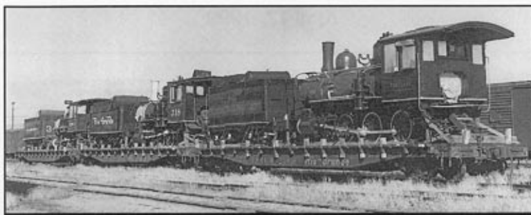
Movement to Golden. Denver, CO. July 12, 1958.