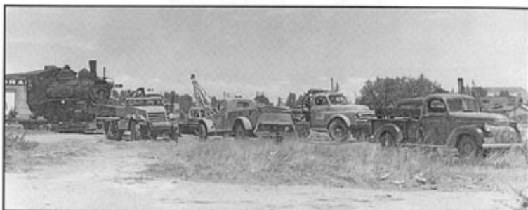
Movement to Narrow Gauge Museum, Alamosa, CO. June 13, 1953.