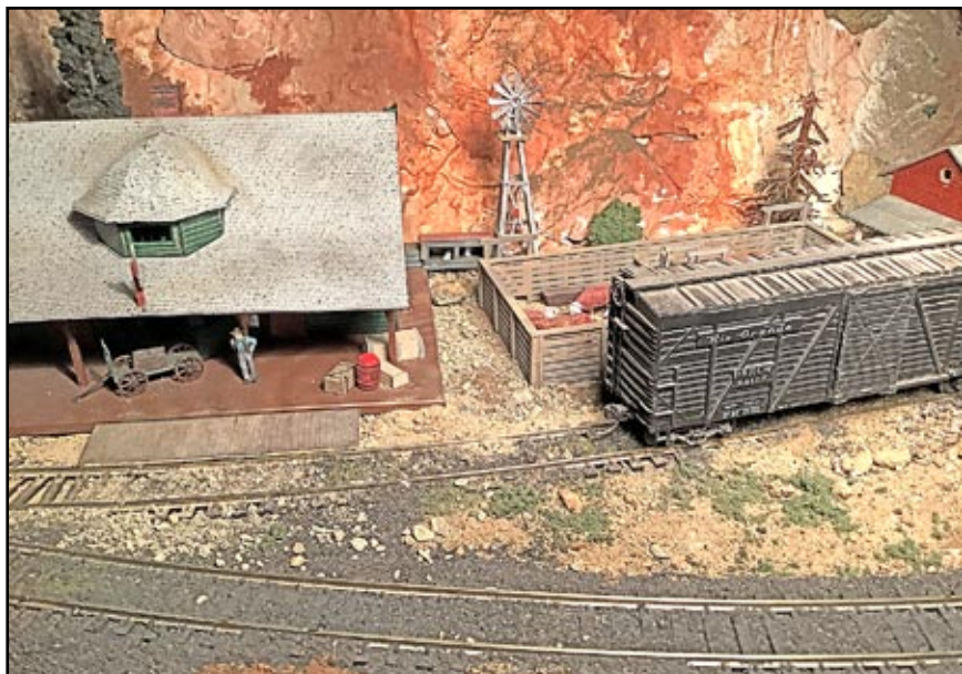
A scene on Denny's model Lake City and Ouray Railroad.