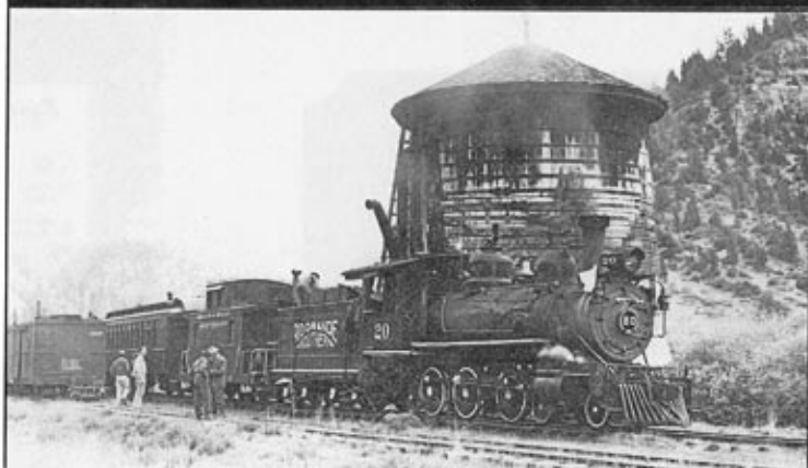
Club excursion at Brown, CO. May 30, 1947.

In January, 1916, the Rio Grande Southern purchased three ten-wheel (4-6-0) locomotives from the defunct Florence & Cripple Creek Railroad. Engine No. 20 was the only one to survive until the end of the RGS. Until the advent of the "Gallopig Goose" motor cars in 1931, these locomotives handled passenger trains between Ridgway, Telluride and Durango. No. 20 made its final run in November of 1951 on a freight train between Rico, Dolores and Durango. In 1952 it was purchased by the Rocky Mountain Railroad Club.