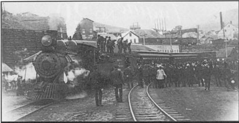
No. 20 at Victor, CO, in May, 1904.