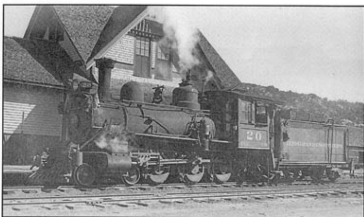
Dolores, CO. September 7, 1941.