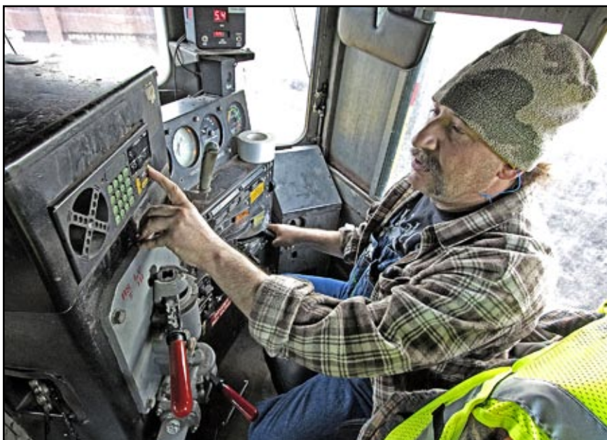
A Mission Mountain Railroad locomotive engineer switches cars in Kalispell, Montana, in spring of 2018.