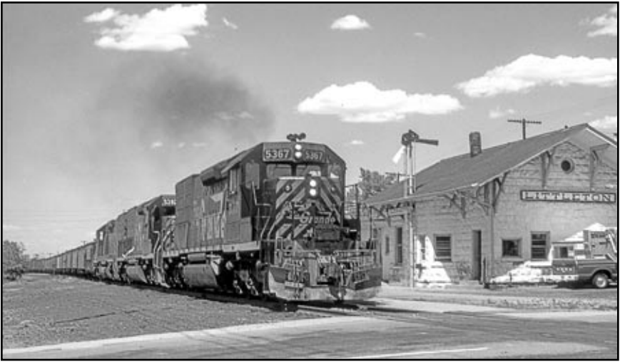
D&RGW 5367 on the lead at Littleton, Colorado, on June 4, 1977.