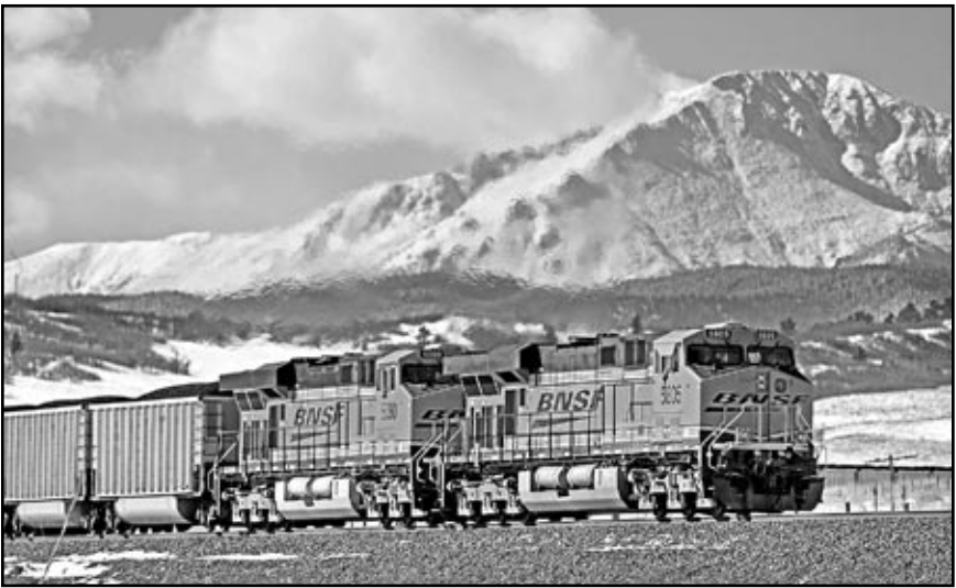
BNSF 5085 and 6090 on the Joint Line at Greenland, Colorado, with Pikes Peak in the background on March 6, 2008.

For Rail Report 696, celebrating the 80th Anniversary, the masthead again features Union Pacific EMD DD-35 #80 at Provo, Utah, on April 22, 1978.