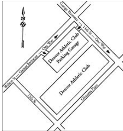
Denver Athletic Club Parking

Oh, did we mention the menu? The consumables begin with a Caesar salad,