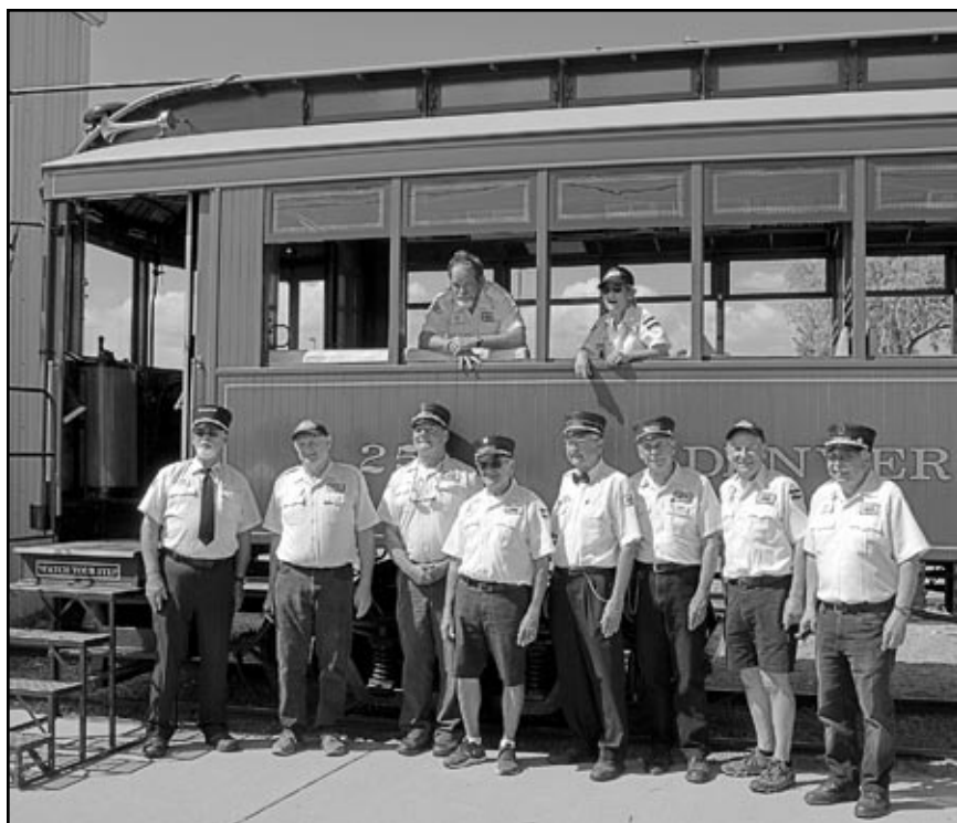
The crew from the Denver Trolley operated No. 25 during the open house.