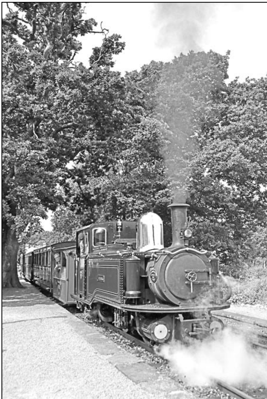
One of the narrow gauge locomotives operating in Northwest Wales.