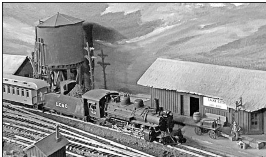
The Lake City depot on Denny's model Lake City and Ouray Railroad.