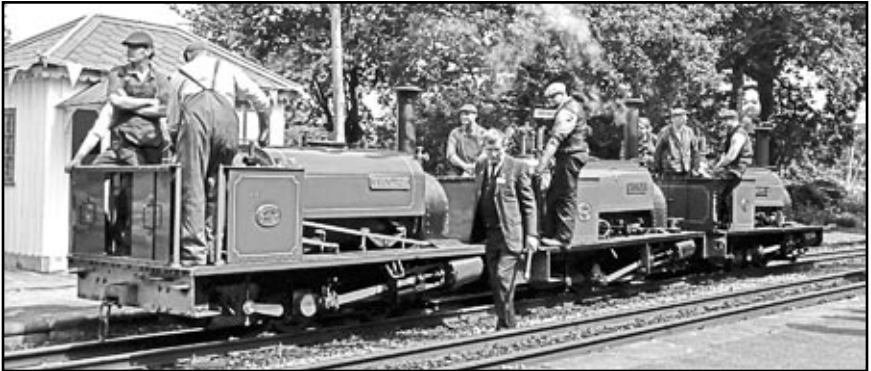
Three of the 25 locomotives on site for the 125th year celebration of the Hunslet Locomotive Company.