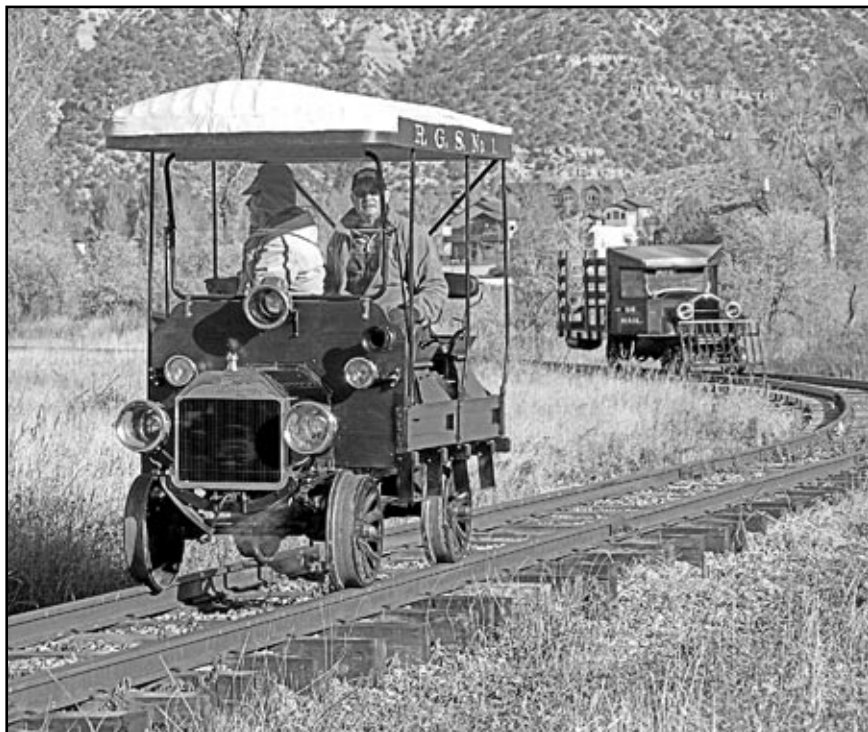
Replicas of RGS Railcar No. 1 and Goose #1 operate at the Ridgway Railroad Museum.