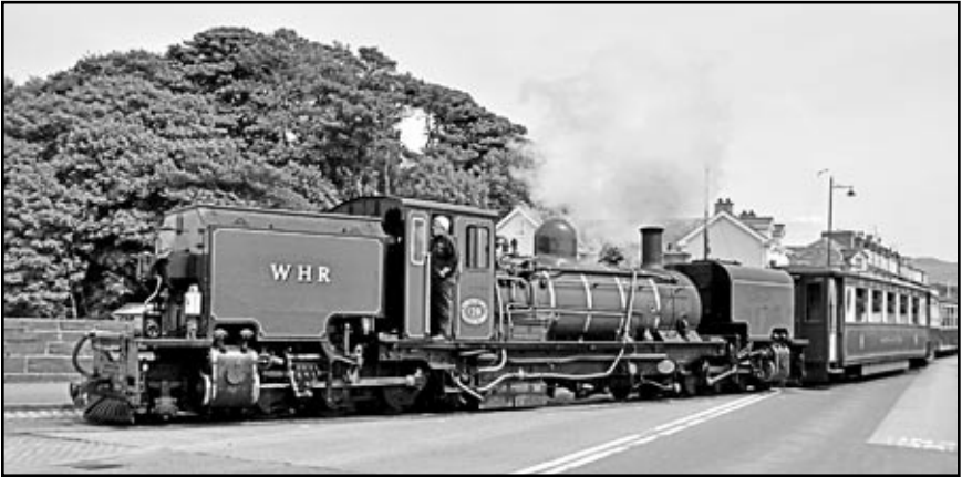
One of the Garratt locomotives departs Porthmadog on the Welsh Highlands Railway.