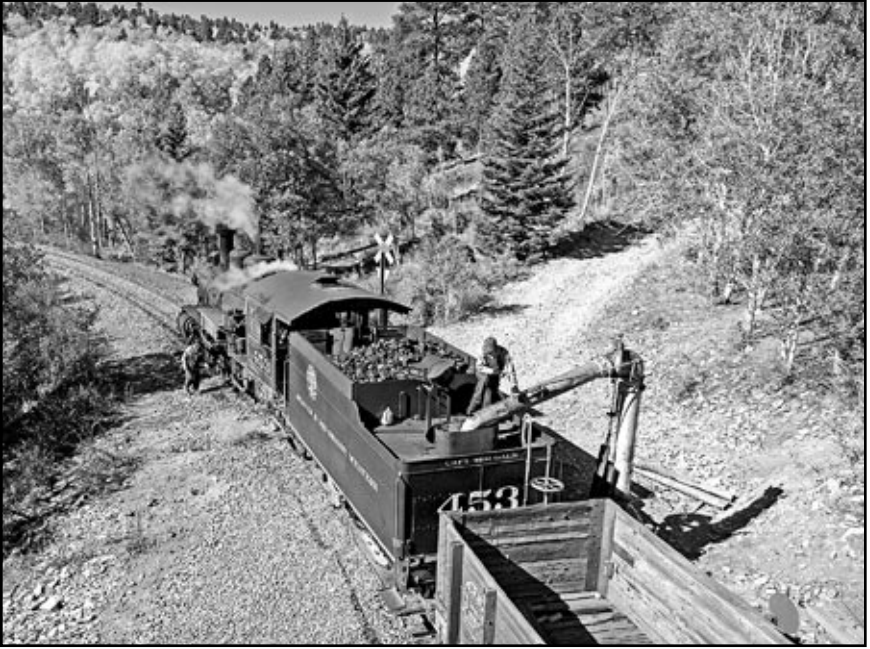
D&RGW #453 (#463 lettered as #453) took on water at the Sublette, New Mexico, stand pipe on September 30, 2018.