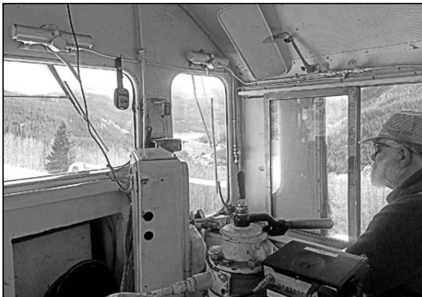
Engineer Pat overlooking the start of the Arkansas River before arriving at the French Gulch Tank.