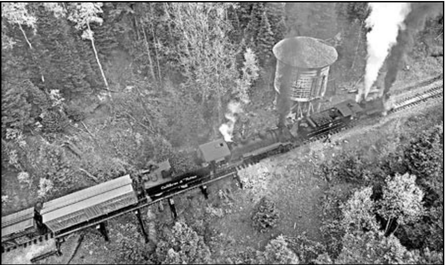
Friends of the C&TS used DRGW #315 with C&TS #484 on an eastbound photo freight stopped here at Cresco Water Tank on October 1, 2018.