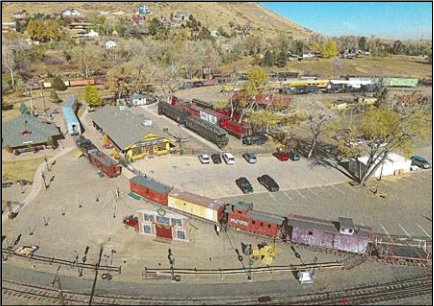
The Colorado Railroad Museum in 2018.

For Rail Report 717, the masthead features New York Chicago & St Louis, NYC&StL, the Nickel Plate Road, NKP 717 at Brewster, Ohio on February 1, 1958.