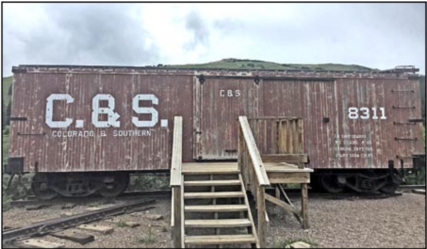
C&S boxcar 8311 currently on display on Boreas Pass.