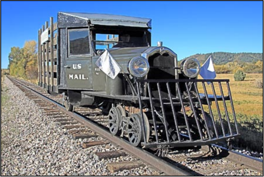
The replica of RGS Motor #1 (the original “Galloping Goose”) at the Ridgway Railroad Museum.

to eat axles. Now that Ridgway has a half mile loop of track that they operate weekly, the axle breakage has become a critical issue. They’ve contracted a local off-roading shop to build a replacement based on a Dana 60 to assure reliable operation through the summer. Our $1,000 will cover 20-25% of the total bill, and should keep Motor #1 reliably creating new RGS fans for years to come.