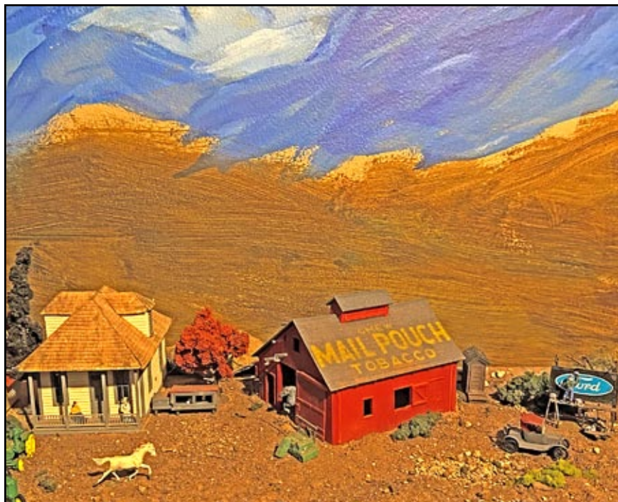
A farm on Denny's model Lake City and Ouray Railroad.