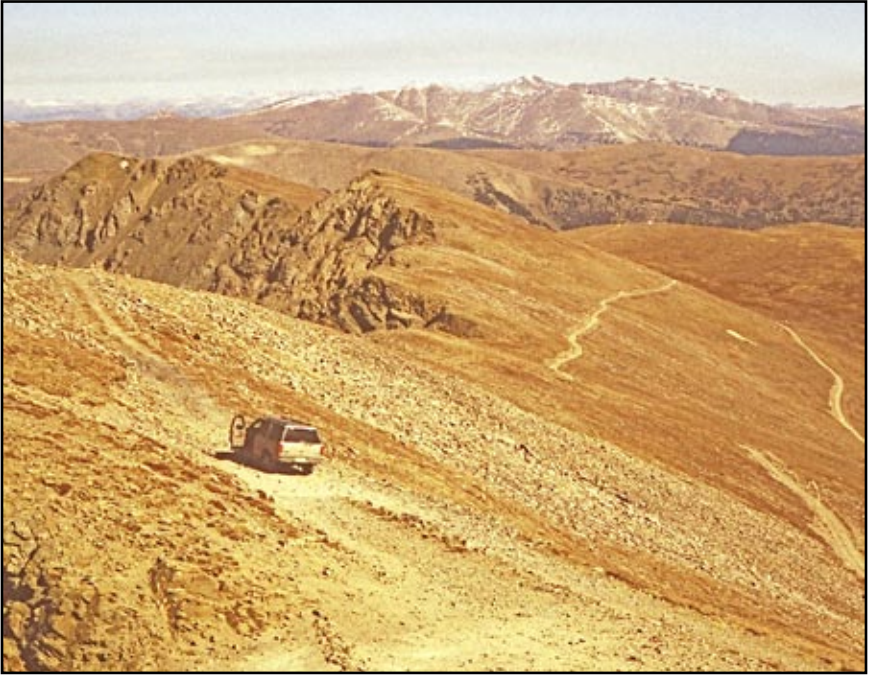
A current view of the Argentine Central end-of-track area.