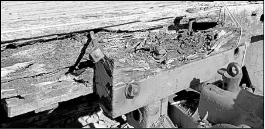
The well rotted end sill on the caboose.

that we needed to remove so we could access the rotted end sill beam to be replaced. As we proceeded, we found that some bolts broke when we attempted to loosen them. Others broke loose, as the rotted wood gave way. We took pictures before we removed parts from the end sill for reference when we reassemble the beam.