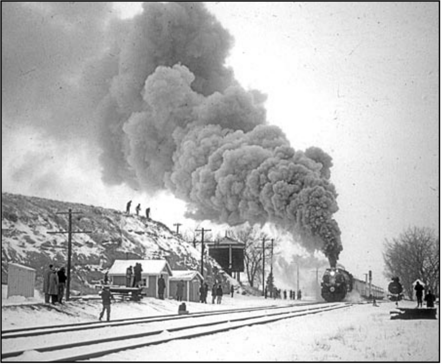
UP 9000 at Dent, Colorado, on March 11, 1956. Due to the near zero temperature, there were only two actual photo stops, one at La Salle and the other at this location.

Pomona, California, through Denver, and is currently on display at the Los Angeles County Fairplex.