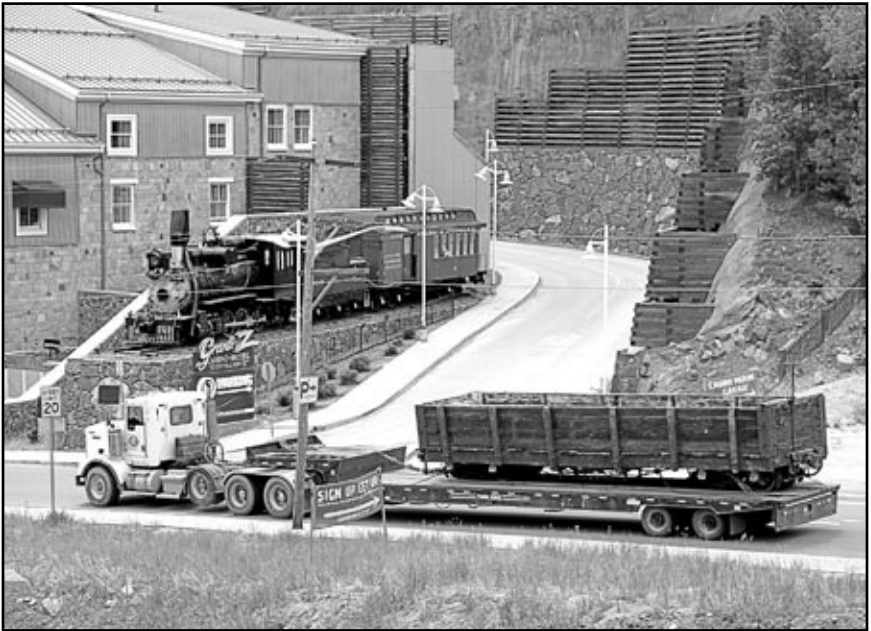
Colorado & Southern gondola 4319 en-route to Como, Colorado, on June 6, 2018, here passing the engine #71 and the combine car in Central City. All three pieces of equipment had been given to the town in 1941.