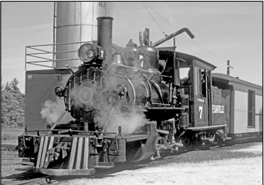
Edaville Railroad at South Carver, Maine in 1976.

For Rail Report 677, the masthead photo features CB&Q 677 at Galesburg, Illinois in 1905.