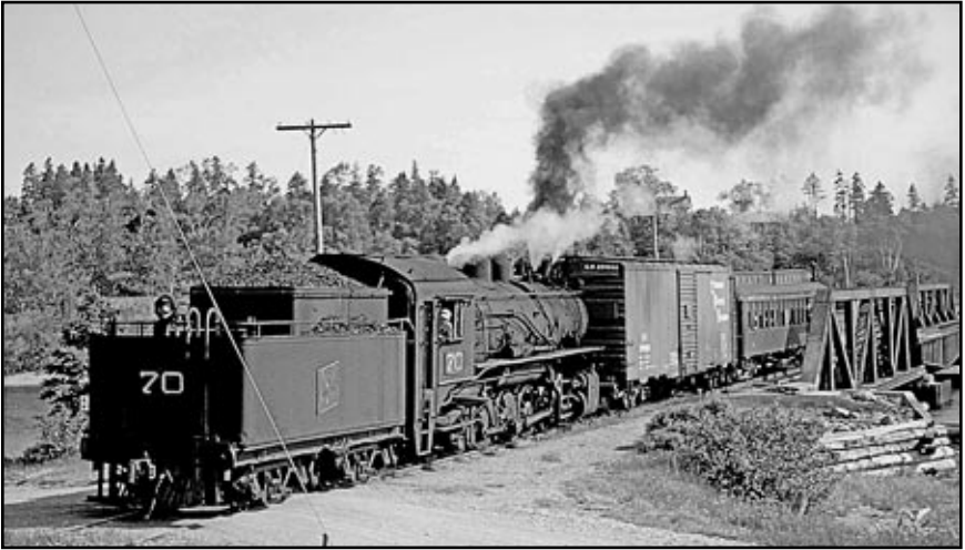
Sydney & Louisburg Railroad, Nova Scotia in 1960.