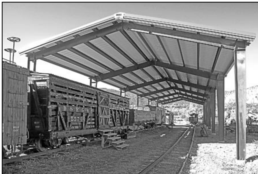
The new Ridgway Railroad Museum open-sided train shed.