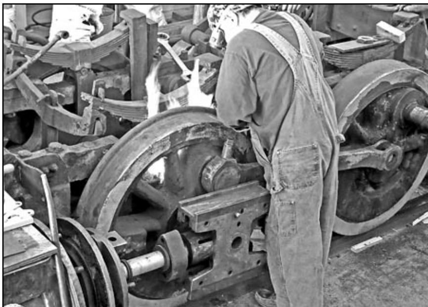
John Braun torching off the pin head to remove the drive rod.