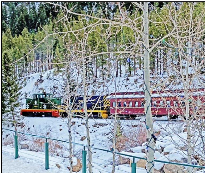
A scene for the holidays on the Georgetown Loop Railroad.