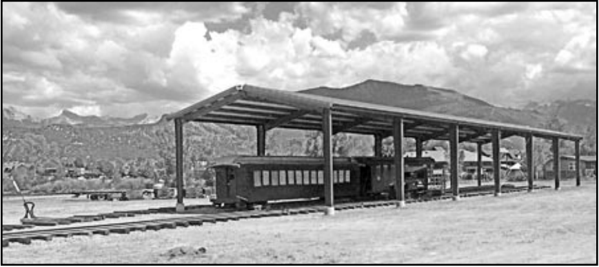
The canopy at the Ridgway RR Museum with two cars on blocks and Galloping Goose #1 on the through track on July 10, 2018.