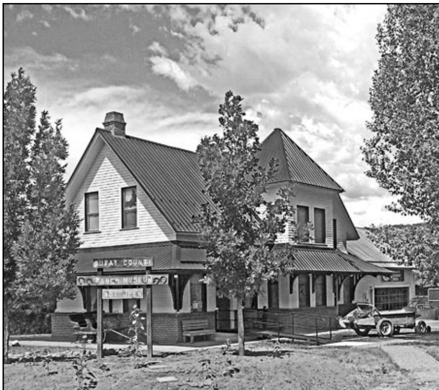
The original RGS Ridgway Depot at the new location.