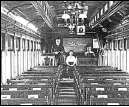
The interior of Baptist car GLAD TIDINGS at Douglas, Wyoming, in 1914.